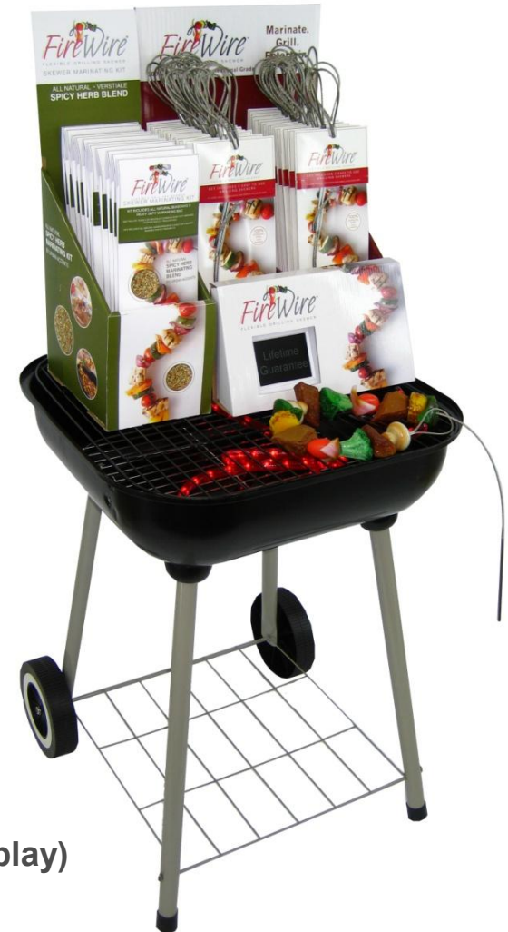
# PP0035 (18" Grill for Display)

This display solution is replacing our current corrugated video floor display. The grill will ship preassembled and the customer can pick and choose the supplemental merchandising aides based on their specific needs such as power availability.